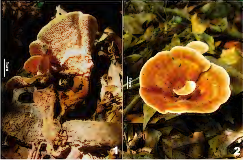
FIGS. 1–2. Basidiome of Microporellus iguazuensis (ICN 154263)

1. Connected to roots of Ocotea indecora , showing the hymenophore. 2. Upper surface.